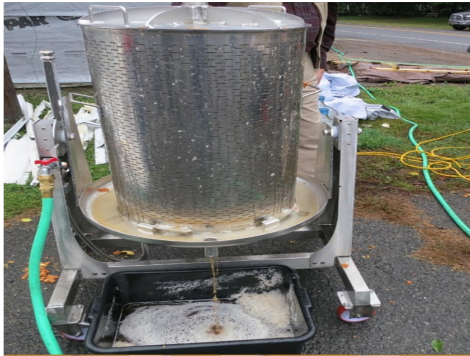
Step 5: Press mashed apples