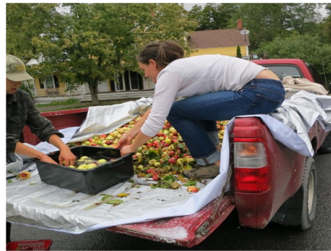
Step 2: Wash the apples