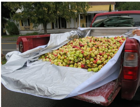
Step 1: Get the apples