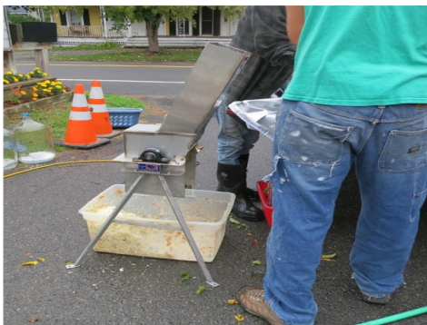
Step 3: Use a device to grind the apples