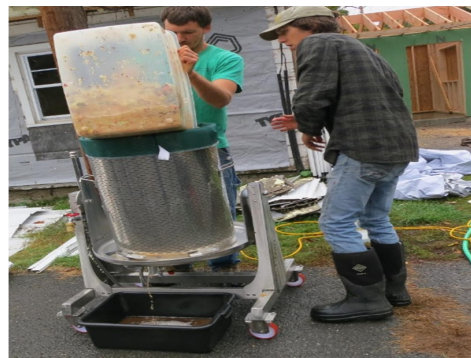
Step 4: Put mashed apples into press